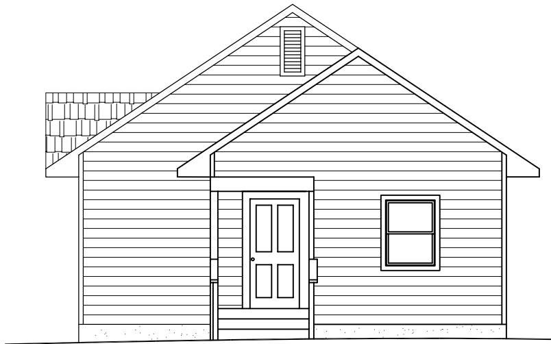
○ EAST ELEVATION 1/8" = 1'-0" 0 2' 4' 8'