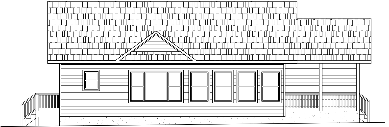
○ SOUTH ELEVATION 1/8" = 1'-0" 0 2' 4' 8'